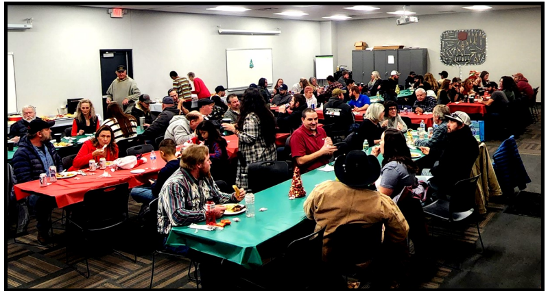
Madison Christmas Party